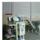
Screw Packaging Machine